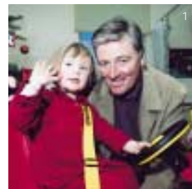
1 Pat Kenny visiting Our lady's Hospital for Sick Children, Crumlin, Dublin prior to the late late toy Show. Pat Kenny ar cuairt chuig Ospidéal Mhuire na Leanaí Breolte, Cromghlinn, Baile Átha Cliath roimh Late Late Show na mbréagán.