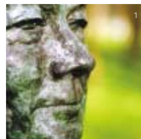
1 Gay Byrne Sculpture. Dealbh Gay Byrne.

The Broadcasting Act, 2001 provides for the means of introducing digital terrestrial television (DTT). In the year 2000, much important groundwork was done in anticipation of the new act to ensure steady progress towards the start up of DTT. Now the Authority must decide and finalise its policy for the introduction of new digital services. This will call for examination of proposals for additional channels and for decisions about when the channels – once approved – can begin broadcasting. Every aspect of the organisation – creative, technological and administrative – will be tested by the introduction of digital services, and the public will derive the advantages of the far-reaching changes now being made in RTÉ. It is an exciting time in broadcasting and I am sure that we can secure a central place for public service media in the extended range of service that digital technology promises.