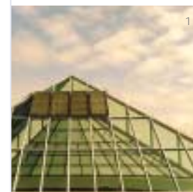
1 Television programmes building (detail). Foirgneamh na gclár teilifíse (cuid de).