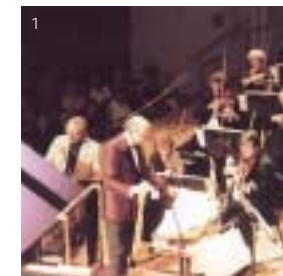
1 The RTÉ Concert Orchestra performing at the Rattlebag Listeners Choice with guest pianist Micheal Ó Súilleabháin, Prionnsias Ó Duinn, conducting. Ceolfhoireann Chóirme RTÉ i mbun ceoil ag an Rattlebag Listeners Choice leis an aoi-phianadóir, Micheal Ó Súilleabháin: Prionnsias Ó Duinn á stiúru.