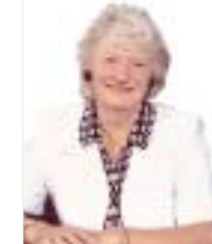
Dame Mary Peters, CBE Olympic medalist and retired business-woman Buaiteoir boinn sna Cluichí Oilimpeacha agus iar-bhean ghnó