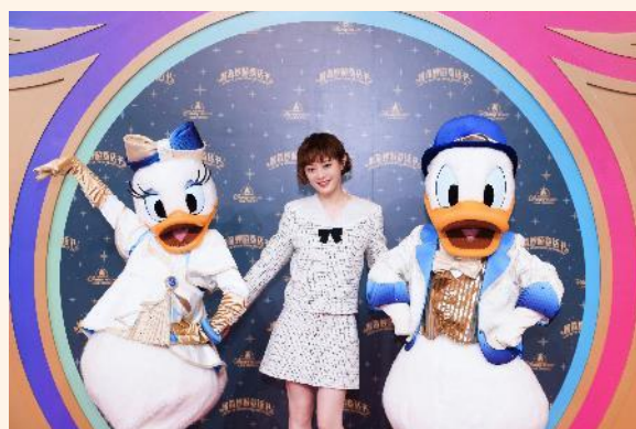
Donald Duck and Daisy Duck alongside the Shanghai Disney Resort Grand Opening Ambassador, actress Sun Li