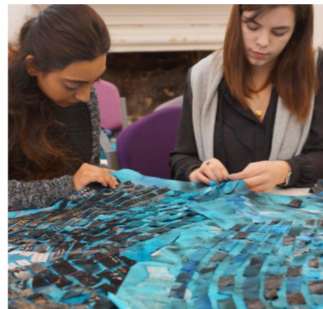
RSN degree students working on Game of Thrones project

Moving into the 21st century, the RSN has managed to inspire a new generation with its modern take on embroidery. In 2002, the school was commissioned to embroider the official logo for the FIFA World Cup in Japan and Korea. In 2006, employees at the RSN produced a piece of embroidery for Sir Paul McCartney's Ecce Cor Meum album cover. In 2016, the RSN received one of its largest commissions to date: a six- by eight-metre embroidered artwork for the series Game of Thrones . Around 50 embroiderers – from the RSN as well as the Embroiderer's Guild, Fine Cell Work (a social enterprise that trains prisoners in needlework) and Hand & Lock Embroidery – worked on the piece, which took around 30,000 hours to complete.