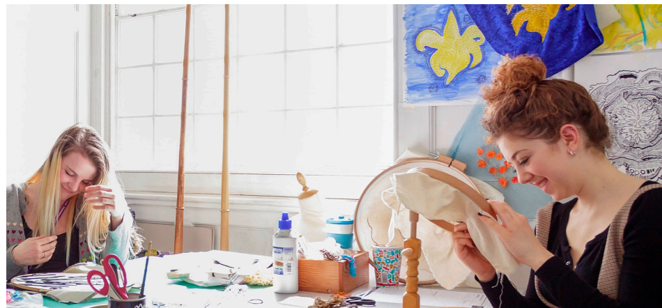
RSN degree students at Hampton Court Palace

Despite these connections, the school is not only devoted to high-class luxury. During the First World War, workers at the RSN taught returning soldiers the craft of embroidery, as a means of therapy. In the Second World War, Lady Smith-Dorrien, president of the RSN at the time, collected lace to be sold for the war effort and at the request of the War Office, the RSN translated the badges of all UK and later Allied forces regiments into patterns for transfers that could be stitched.