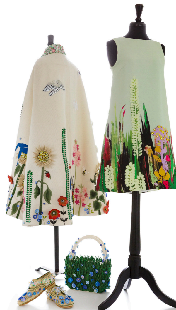
Livia Papiernik, RSN degree graduate 2018

Visit the Stitch Bank at rsnstitchbank.org , where you can browse stitches by technique, use or structure, and save your favourites to your own list to come back to later.