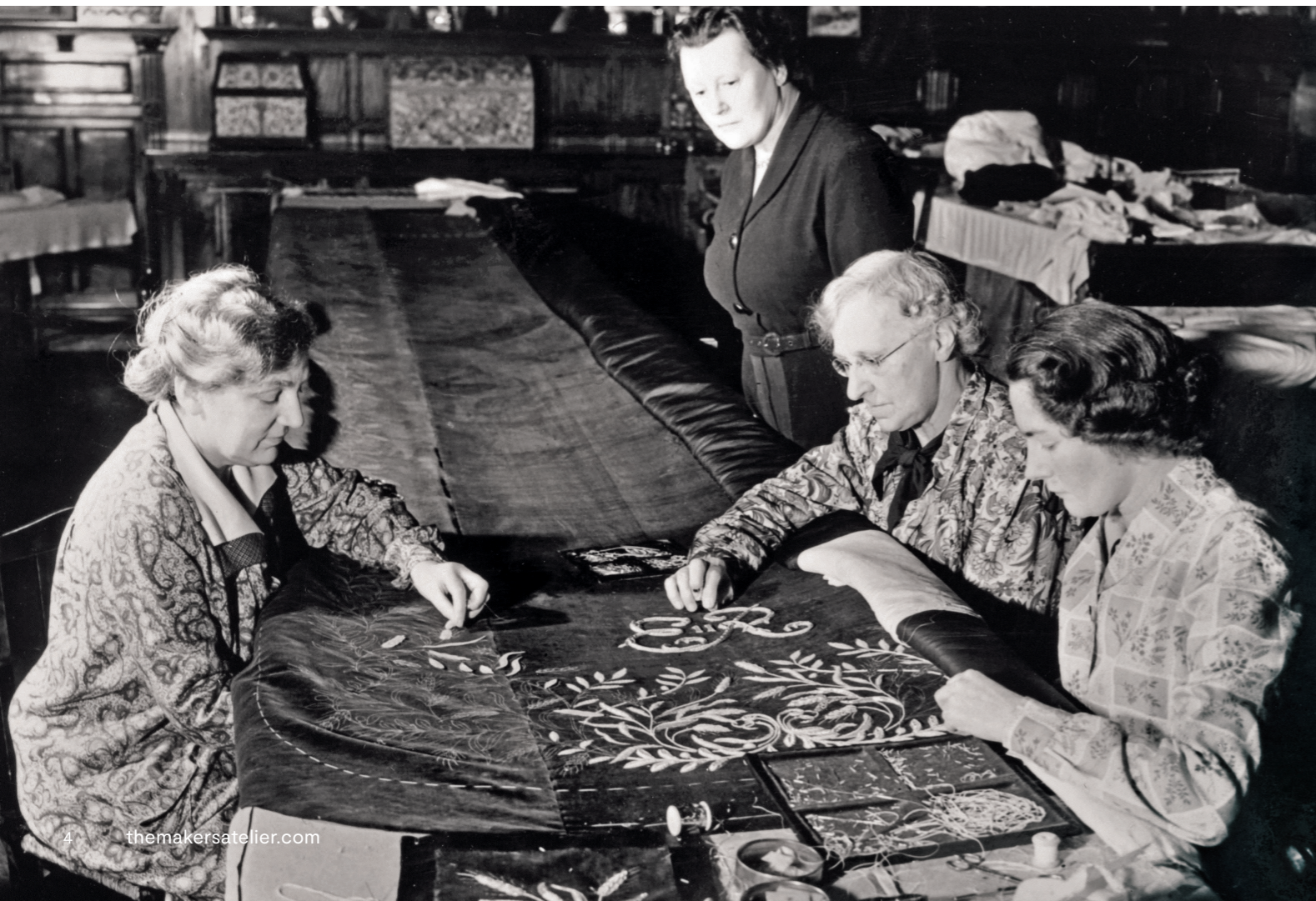
The RSN working on The Queen's Coronation Robe