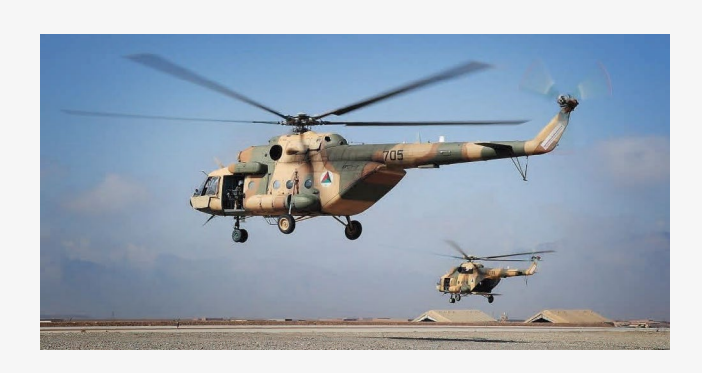
The SMW has received all 30 Mi-17 helicopters planned for delivery. The aircraft conducts light lift, personnel transport, CASEVAC, resupply, air interdiction, aerial escort, and armed overwatch missions. Every aircraft is armed with two 7.62mm door guns, and 12 have 23mm Forward Firing Cannons.

DoD reported that, as of June 2015, the SMW had 82 fully trained pilots (67 for the Mi-17s and