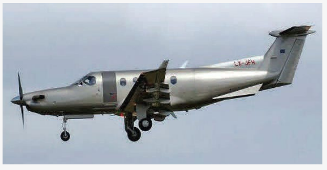
The SMW has received 13 of 18 PC-12 aircraft planned. The aircraft provides airborne intelligence, surveillance, and reconnaissance capabilities.