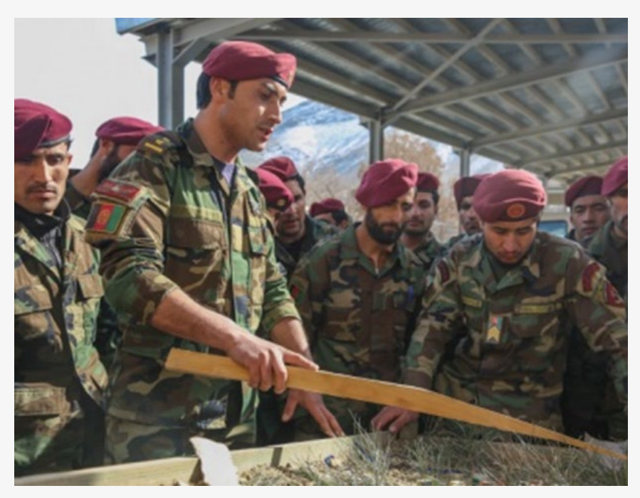
An Afghan commando leader from 6th Special Operations Kandak gives a mission brief on an operation near Kabul province, Afghanistan.

Afghanistan has five special security forces organizations, with a combined force strength of more than 18,000 personnel, which conduct direct-action missions against insurgents and their facilitators:<sup>62</sup>