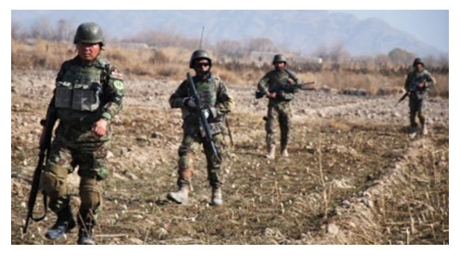
Afghan soldiers patrol in southeastern Afghanistan during a large-scale, coordinated operation to attack anti-government forces' safe havens.