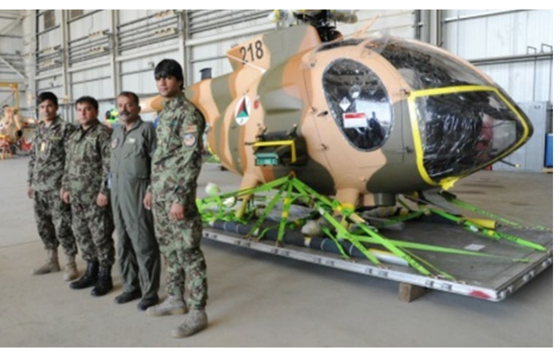
Afghan Airmen pose in front of the newest aircraft (one of six MD-530s) to enter the Afghan Air Force inventory on March 18, 2015.