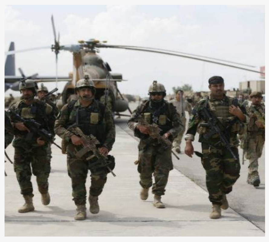
Forces from Afghanistan's Critical Response Unit in full battle gear.

Regarding operations, DoD reported that, during December–May 2015, the SMW conducted more than 840 Mi-17 and 1,008 PC-12 operations and training missions, proving its ability to provide ISR, develop targets, and conduct mission overwatch during infiltration and exfiltration of aircraft and ground personnel.