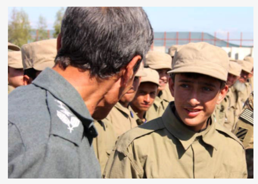
Local Police trainees at the Afghan police Regional Training Center in Nangarhar province in March 2015.

The ALP program began as an initiative of the Coalition Forces Special Operations Component Command-Afghanistan, but it is a village defense force, not an MOI special police force. The original MOI validation process for ALP members included approval by both the village elders and the Coalition partners.<sup>75</sup> In October 2014, the coalition reported that an MOI-certified ALP program of instruction had been newly integrated into the curriculum at the regional and provincial training centers. Because ALP units operate