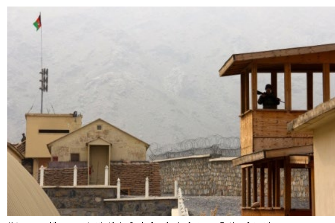
Afghan\ army\ soldiers\ on\ watch\ at\ the\ Khyber\ Border\ Coordination\ Center\ near\ Torkham\ Gate\ at\ the\ Afghanistan-Pakistan\ border\ January\ 4,\ 2015.

arrangements and agreements—from status of personnel issues to defense and security cooperation mechanisms. According to BSA Article 26, the agreement will remain in force from January 1, 2015, to December 31, 2024, and beyond, unless formally terminated, with notice.<sup>25</sup>