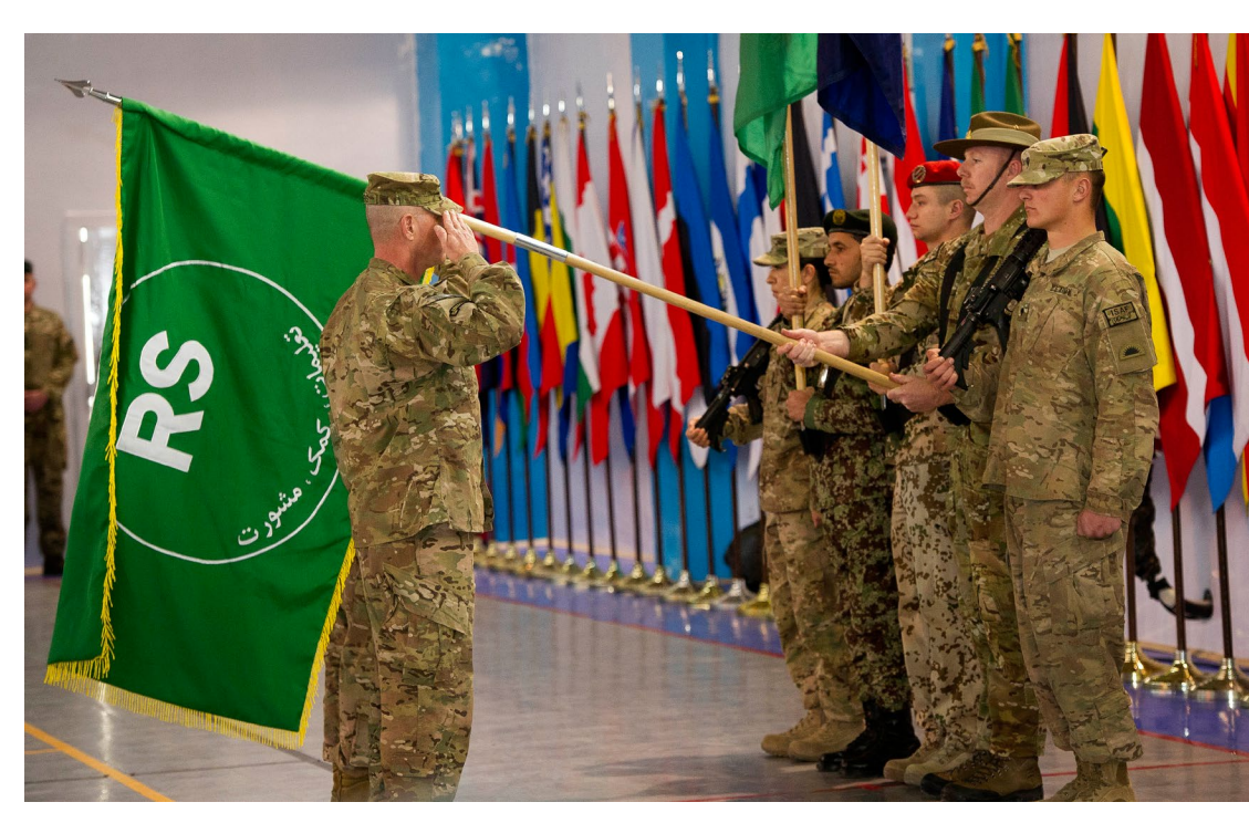
Change of mission ceremony for Resolute Support held in Kabul, Afghanistan, in December 2014.

subsequently committed to maintaining up to 9,800 troops through the end of 2015 in response to President Mohammad Ashraf Ghani's request for flexibility in the U.S. drawdown timeline. According to DoD, the United States will maintain its force level below 9,800 through the end of 2015, and, later this year, will establish plans for additional force drawdowns, which will begin in 2016.