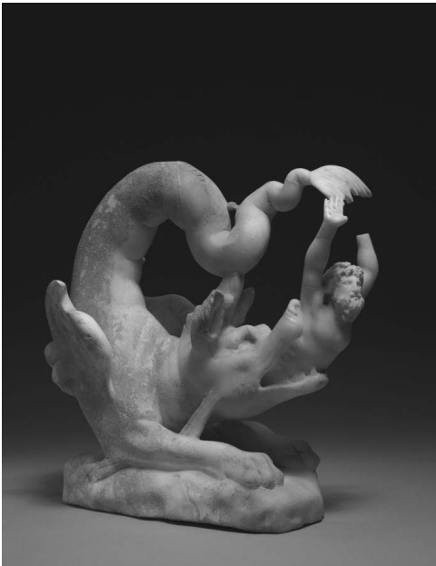
Figure 2. Statue, marble. Jonah Cast Up, Cleveland Museum of Art, ca. 280-290 CE.