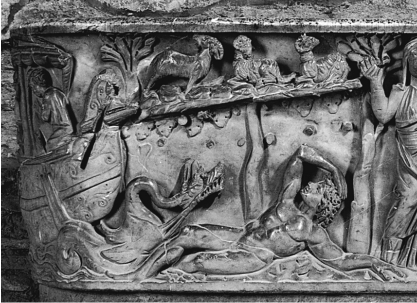
Figure 1. Sarcophagus, Church of Santa Maria Antiqua, Rome, ca. 270 CE.