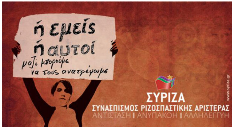
Figure 3. SYRIZA poster for the May 2012 elections.

ongoing ‘war of positions,’ a broader confrontation is staged, where the enemy is neoliberalism and its advocates (international financial institutions like the IMF and the current leadership of the EU). It is in the context of this second level that one should also assess the recent visit of Tsipras to left-wing Latin American governments. For Tsipras and SYRIZA ‘[today’s] Europe is on edge. Two worlds collide. On one side stand the productive forces of democracy, the people fighting to create a society of justice, equality and freedom. On the other side, a neoliberal biopolitical project unfolds.’ 51 There are various operations in SYRIZA’s discourse through which those two levels are linked. The most telling one was the pun often used by Tsipras about ‘troika exoterikou —troika esoterikou ’ (external troika—internal troika) 52 where the three-party coalition government between ND, PASOK and DIMAR was effectively equated with the country’s emergency lenders, the EC, the ECB and the IMF.