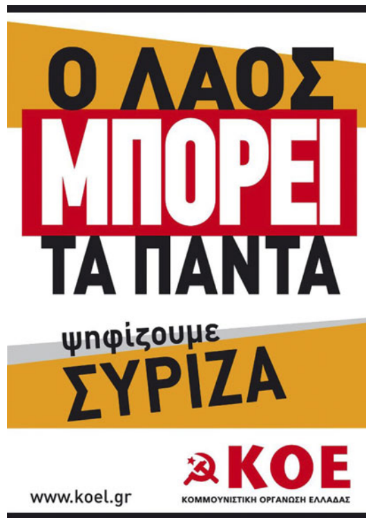
Figure 1. KOE poster for the June 2012 elections.

SYRIZA's main slogan for the campaign of the May 2012 elections gives a first revealing answer: 'They decided without us, we're moving on without them' (see Figure 2). This slogan, along with other similar ones, aimed to capture popular sentiments of frustration and anger against the harsh austerity measures; at the same time, it purported to point to an alternative path, building on popular hope for something better, something 'new,' for an alternative. It functioned as a discursive tool to establish 'chains of equivalence' among heterogeneous frustrated subjects, identities, demands and interests by establishing and/or highlighting their opposition to a common 'other': the 'enemy of the people,' that is the 'pro-austerity forces,' the 'memorandum,' the 'troika' and so on; in this discourse, all these forces, also organized through an equavalential logic, were presented as distinct but interrelated moments of the 'establishment.' SYRIZA's discourse thus divided the social space into two opposing camps: 'them' (the 'establishment,' the 'elite') and 'us' ('the people'), power and the underdog, the elite and the non-privileged, those 'up' and the others 'down.'