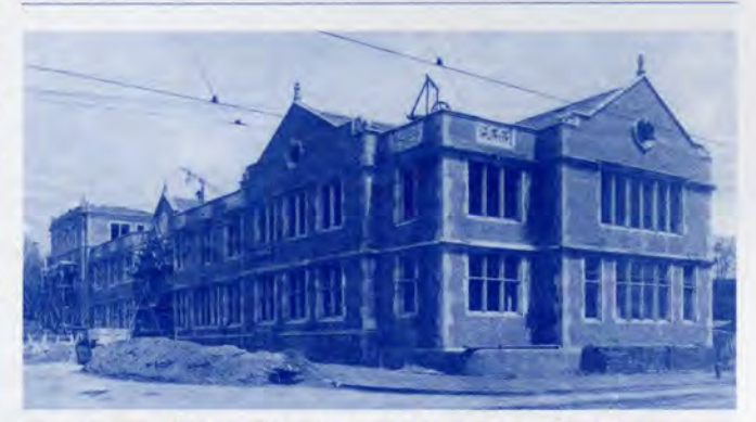
100 YEARS AGO: 1907: The "Old Quadrangle" Veterinary Building under construction. In January 2007 the School of Veterinary Medicine opened its acclaimed new Hill Pavilion at 380 South University Avenue. Exactly one century earlier, as shown here, the School was nearing completion of what is now known as the "Old Quadrangle" at 3800 Spruce Street. Collections of the University Archives and Records Center.

The Commencement of 1907 also demonstrated the extent to which Penn's professional schools had eclipsed the College in the University's public profile. The Provost conferred a total of 558 degrees, only sixty of which were in the College. The College faculty still required proficiency in both Latin and Greek for the traditional Bachelor of Arts, with the result being that only twenty students earned this degree. There was one Bachelor of Music and thirty-nine Bachelors of Science (that is, College students who did not take the courses in Latin and Greek). By comparison, there were 112 Bachelors in the School of Engineering and Applied Science and twenty-six in the Wharton School. The Master of Arts was conferred upon twentyfour students and the Doctor of Philosophy on twenty-six. The schools of Medicine, Law, Dental Medicine, and Veterinary Medicine granted II3, seventy-three, ninety-six, and twenty-seven degrees, respectively. In terms of market share, seventy-eight percent of degrees were in the professions, while just twenty-one percent of degrees were in the arts and sciences. The dominance of the professional schools was to continue throughout the first half of the 20th century.