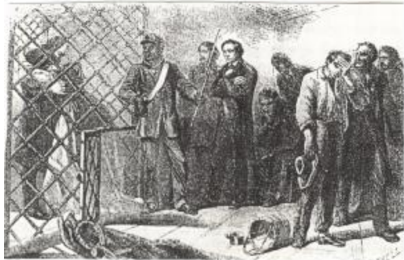
Drawing of a cell (iron cage) --- Knox County Jail from Sketches of the Rise, Progress and Decline of Secession by Wm. G. Brownlow, 1862