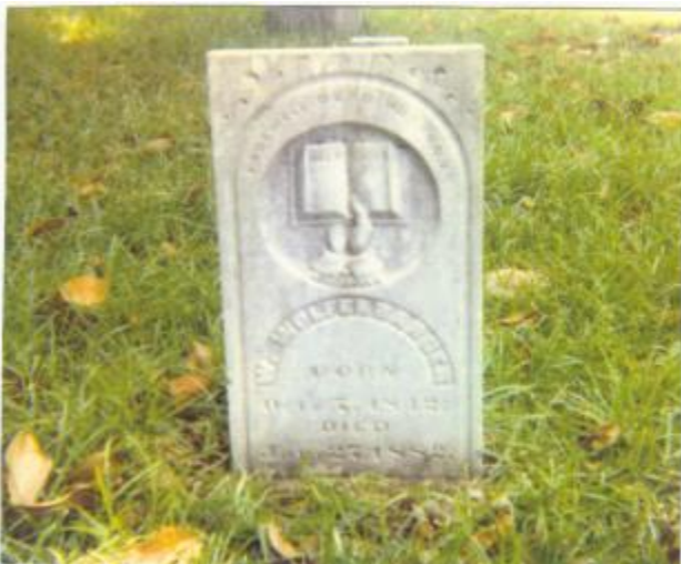
Wilkerson's Grave, Gilmer City Cemetery, Upshur Co., Texas as it appeared October 1981