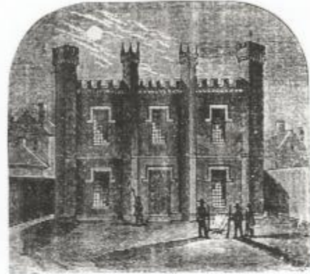
Drawing of the Knox County Jail in 1866 from Pictorial History of the Civil War by Lossing