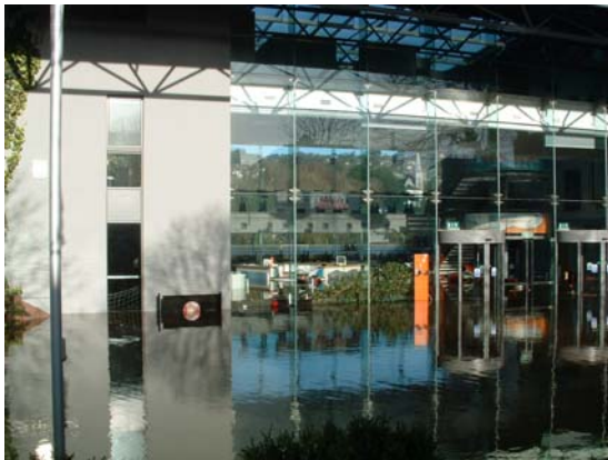
Entrance To Mardyke Arena