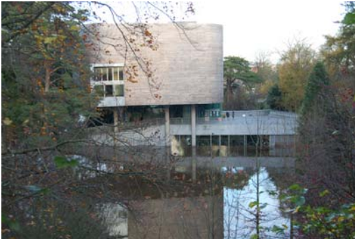
Gallery from west