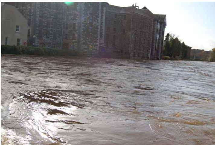
View from Grenville Place (quay wall collapsed)