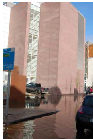
New Laboratory Building