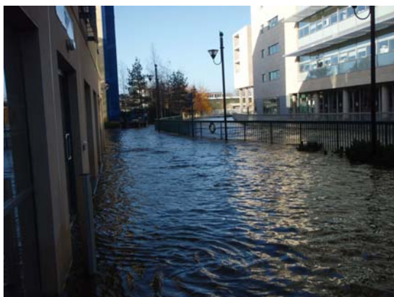
Extent of Flooding