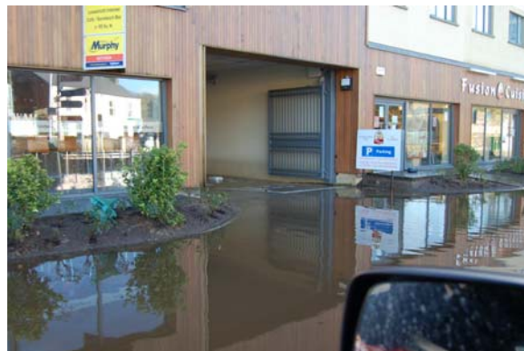
Entrance to Basement