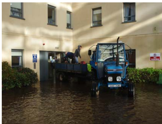
Evacuation of students