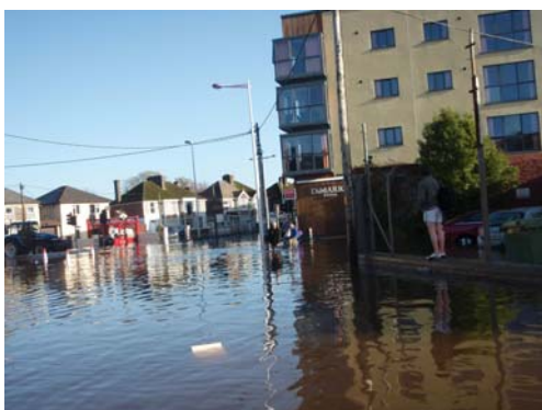
Extent of Flooding