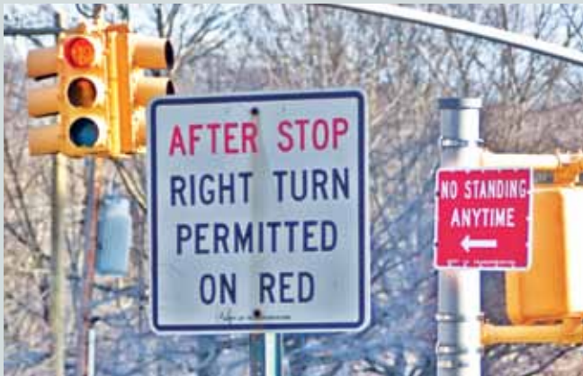
New signs were installed at the 56 approaches on Staten Island where RTOR is now allowed.

The overall study was built around a two-tiered review process that would qualify an intersection to be considered as a potential RTOR location. The initial assessment considered surrounding land uses, accident history, roadway geometries and the presence of a school crosswalk or signal phasing that allowed for leading pedestrian intervals or an