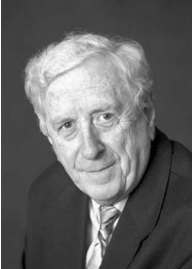
Dr. Garret FitzGerald, BA, PhD, MRIA Chancellor, National University of Ireland.