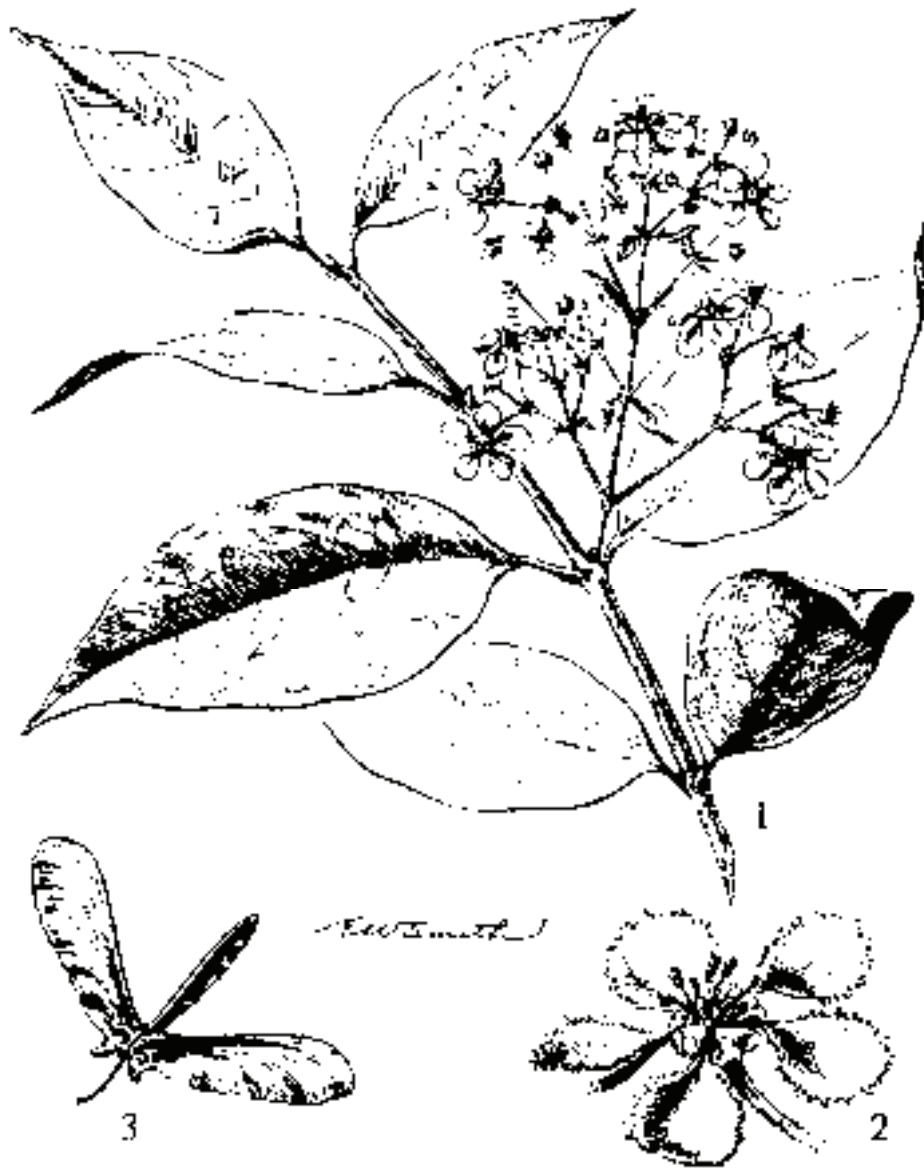
Figure 1: Banisteriopsis caapi (Schultes and Hofmann 1980:164)