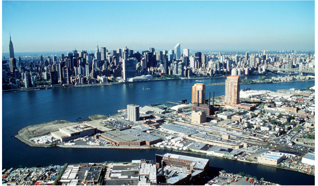
Hunters Point South, Queens Tom Schaller and FXFOWLE