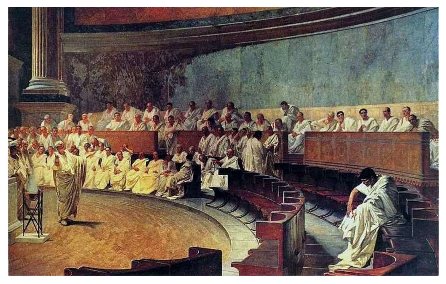
FIGURE 3 CESARE MACCARI, <u>CICERO DENOUNCES CATILINE</u>, 1889.<sup>38</sup>