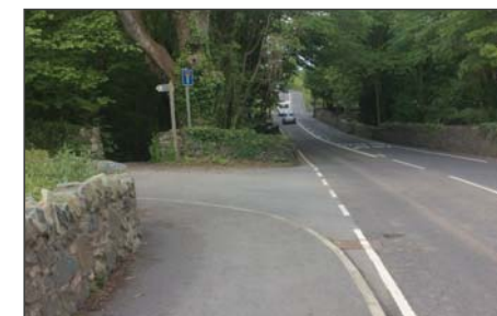
It's a nice break leaving this busy road and joining the Isle of Anglesey Coastal Path.

At the toll house, turn right down the lane signposted for Newborough A4080. There is no pavement on this side so you will need to cross over, as the road can get quite busy. You have to keep crossing when the pavement ends (about three times in total) until you are back on the left side. You will soon see a wooded track to take leading off to your left, signposted 'Isle of Anglesey Coastal Path'.