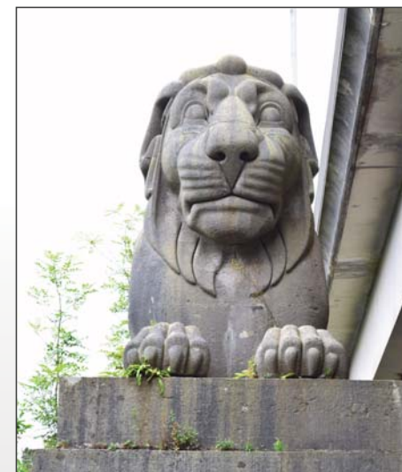
No you're not at Trafalgar Square, but still in Llanfair PG! This is one of the four undercover stone lions keeping guard over the entrance to the Britannia Bridge.

The original Britannia Bridge was decorated by four large lions sculpted in limestone by John Thomas, to complement the Egyptian references in the bridge's structural masonry. The lions flanked both entrances at either side of the bridge, and were an amazing spectacle for the train passengers approaching the bridge between 1850 and 1970. Since the new road deck was added in 1980, the lions are now hidden below, and out of view of the passing cars. But train passengers may still catch a quick glimpse as they pass.