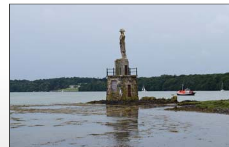
Lord Nelson keeps a watchful eye over the Strait.

Nelson was also reputed to have described the Menai Strait as "one of the most treacherous stretches of sea in the world".