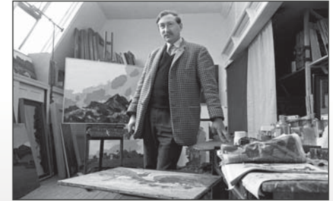
Sir Kyffin Williams loved the light on Anglesey, and enjoyed painting the rugged landscapes of north Wales nearby.

Kyffin loved his home in Pwllfanogl, especially the light there. His good friend the Marquess of Anglesey had a room adapted for Kyffin to paint and it's from here he created many great paintings.