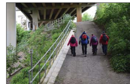
A quick detour to look for lions in Llanfair PG?

NB - Please remember that railway tracks are extremely dangerous places so do not attempt to cross the barriers.