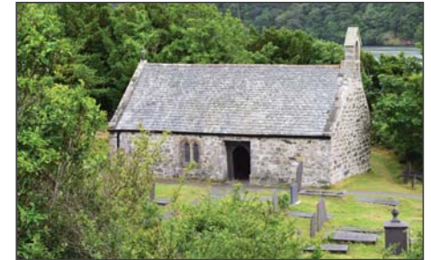
The little church dedicated to Saint Tysilio is well worth a quick look.

Heading back, take a quick detour to visit the little 15th century church dedicated to St Tysilio. Leaving Church Island, turn right at the end of the causeway and you're now walking along 'The Belgium Promenade'.