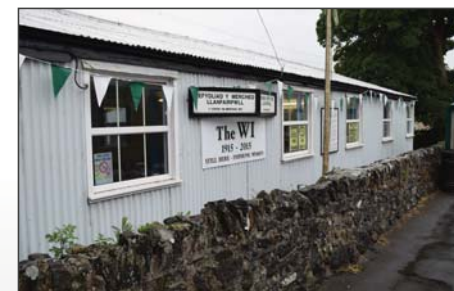
The first WI in Britain was established here in 1915, and is still used by the local WI today.

Today the WI is a worldwide movement, and the largest voluntary women's organisation in the UK.