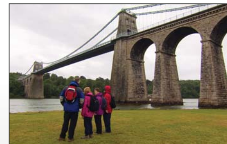
Thomas Telford's suspension bridge is a breath-taking feat of engineering, and a great place to finish the walk.

Completed in just seven years the suspension bridge made Telford a civil engineering superhero and his beautiful bridge is still as awe-inspiring today.